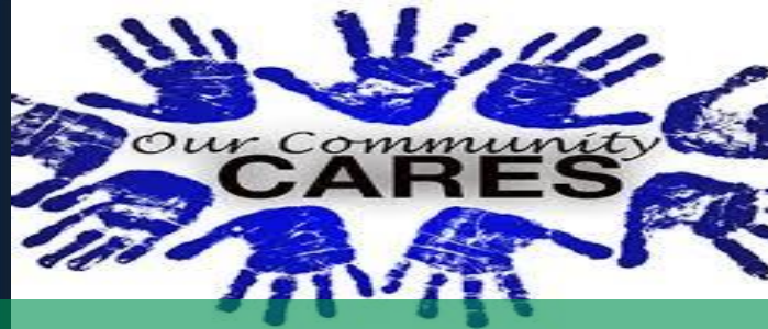
Civic Organizations & Community Foundations